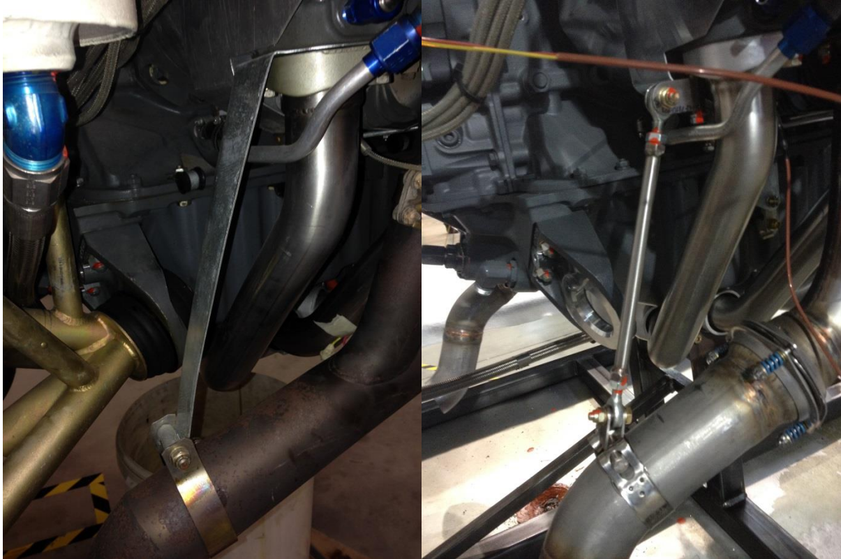
Figure 1: Old exhaust brace (XA42-7810-214) (Left); new exhaust brace (XA42-7810-101) (Right)